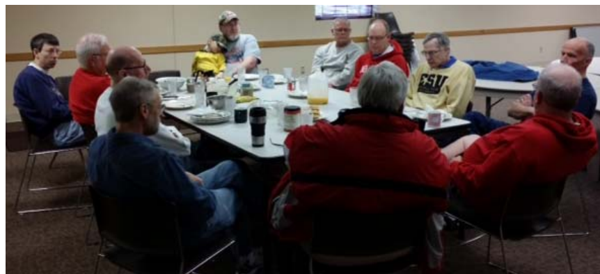
A few of the "Usual Suspects" at Saturday morning breakfast

"I" refers to many things. "I," the ninth letter of the English alphabet, or defined as personal ownership or of self, would like to show that it points to one of my favorite words—Invitation. In the Men's News Corner, we like to use the act of invitation to involve as many men as possible in various Christian activities through fellowship at Lord of Love. The following notes are mostly up and coming events that include men at Lord of Love. Please know that these are also invitations to participate in various forms of men's fellowship.