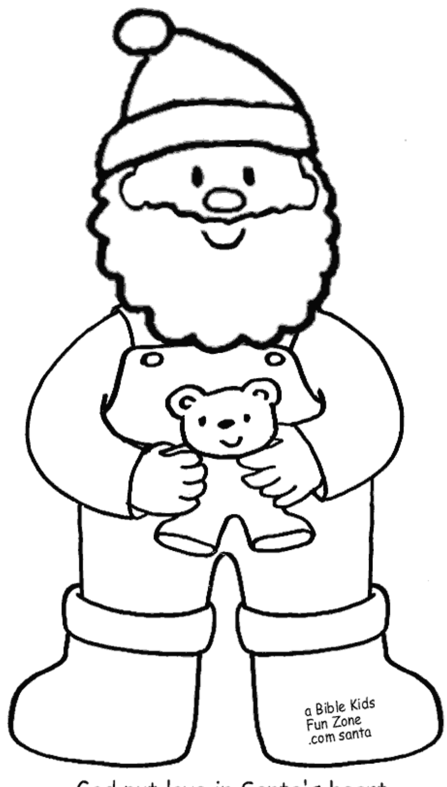
God put love in Santa's heart