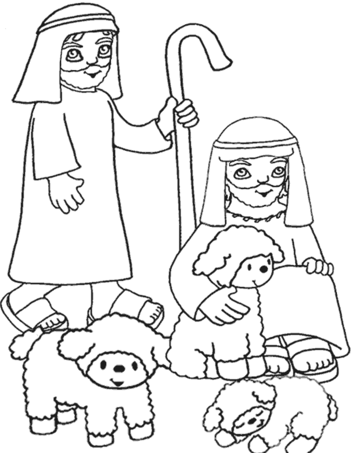
Bible Kids Fun Zone grants permission to photocopy this page for local church or preschool use. © Copyright Bible Kids Fun Zone 1999, 2005.