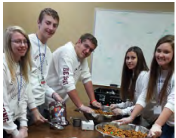
Above: At the food pantry making trail mix for the sack lunch program.