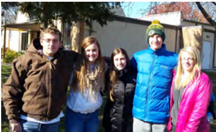
Above: Outside for the Walk for Water activity.

These opportunities are so important and I am grateful that our youth have the support of their families and congregation to attend! Next year's event will be held at Carol Joy Holling in November 2016.