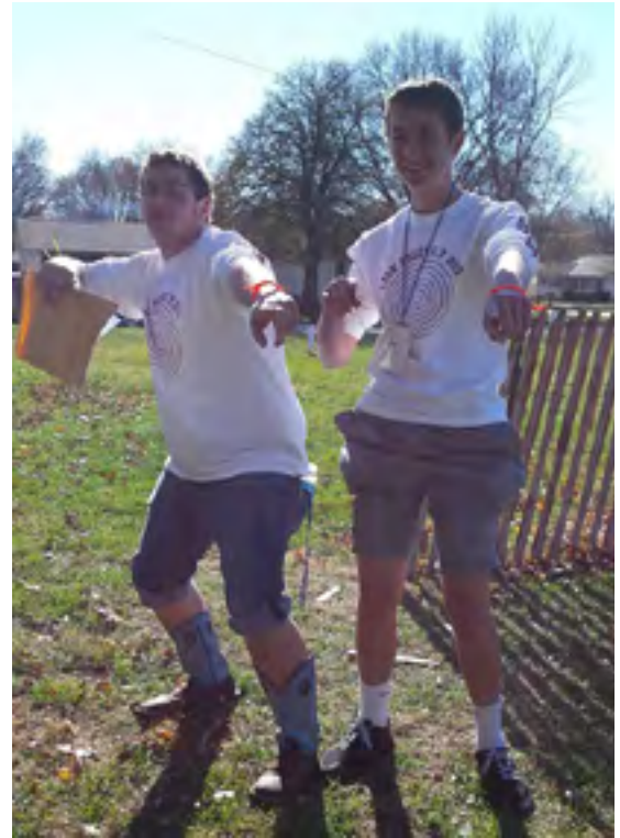
Above: Walk for Water educational/interactive activity. These boys were challenged to be uncomfortable while getting water. On that cold day, it meant no coat, hat, gloves. In another country it might mean hot temperatures and no shoes.