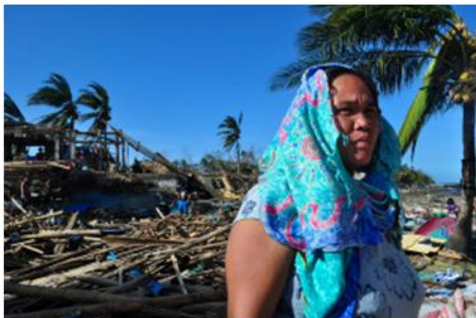
Damage caused by Super Typhoon Haiyan.

Lutheran Disaster Response – International is committing $1 million to Lutheran World Relief to collaboratively address the needs of the people impacted by Super Typhoon Haiyan.