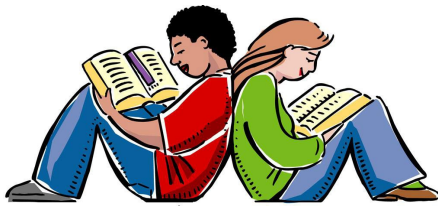
HIGH SCHOOL BIBLE STUDY

Bible Study for our high school youth grades 9-12 has begun. Youth are invited to join a time of study and devotion on Wednesdays from 7-8:15 p.m.