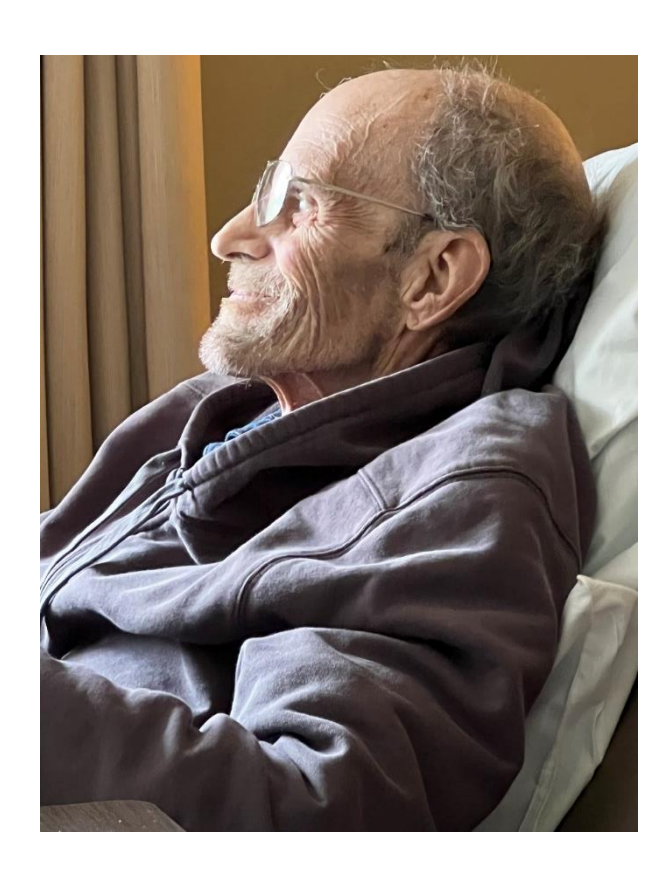
November 30, 2022 Lord of Love Lutheran Church 10405 Fort Street Omaha, NE 68134

Isaiah 40:31 But they that wait upon the Lord shall renew their strength; they shall mount up with wings as eagles; they shall run and not be weary; they shall walk and not faint.